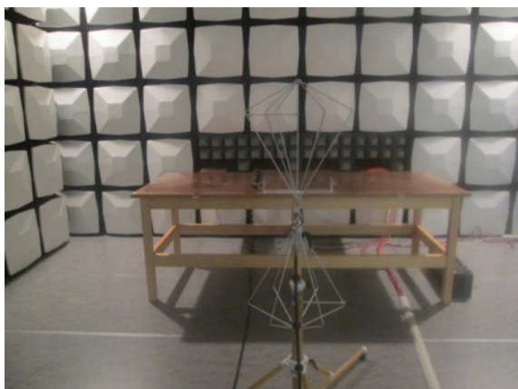
Fig. 2. Testing setup for chamber validation with biconic antenna